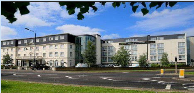
(LONDON CROYDON AERODROME HOTEL)