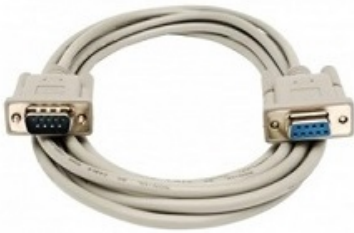
Modem Cable - Straight Cable DB9 to DB9