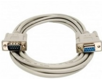
Modem Cable - Straight Cable DB9 to DB9