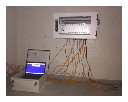
The CR-6plus installed in the Centre Block, ready to record seismic data.