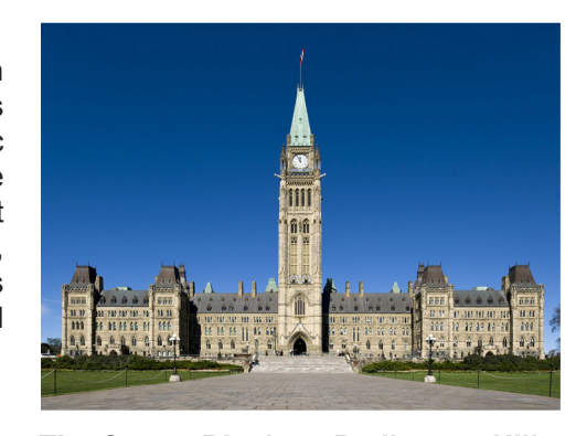
The Centre Block on Parliament Hill.

AC-73 accelerometer sensors CR-6plus central recorder GeoDAS software