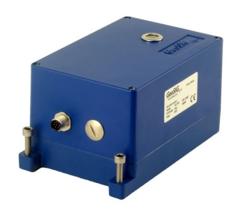
Accelerometer sensors AC-73