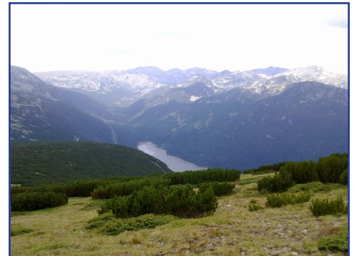
Beli Iskar Dam at the foot of the Moussala Summit.