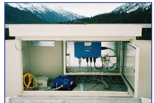
GeoSIG instrumentation in place