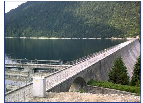
Beli Iskar Dam, Bulgaria